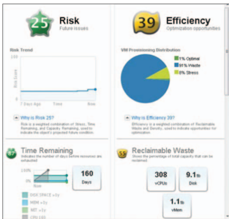
Figure 5: Capacity is rated for both risk and efficiency; opportunities for reclaimable waste are identified.